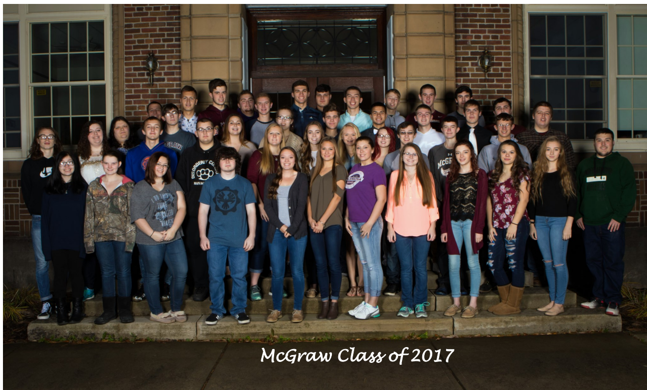
McGraw Class of 2017